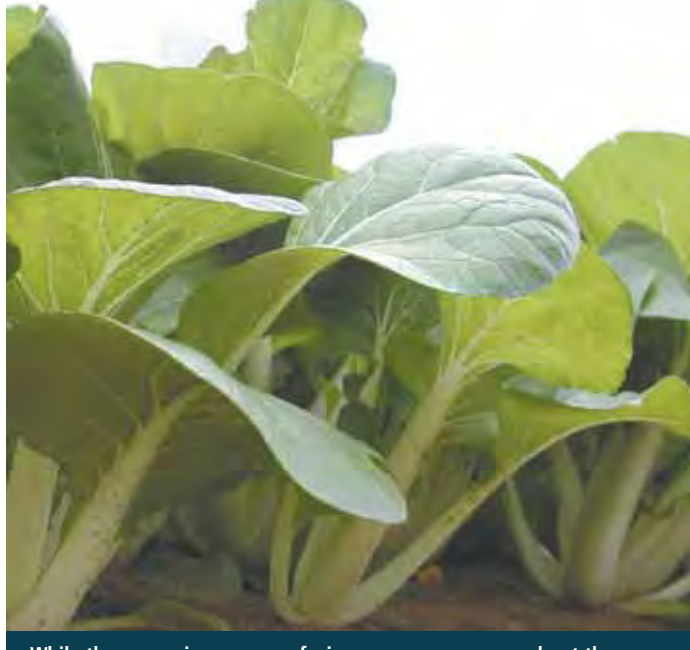
While there remains some confusion among consumers about the names of Asian vegetables, buk choy was remembered and readily mentioned by all participants in the focus groups.

The focus groups and surveys found that shopping for food is still very much the responsibility of women in the household. Overall, it is an activity most do