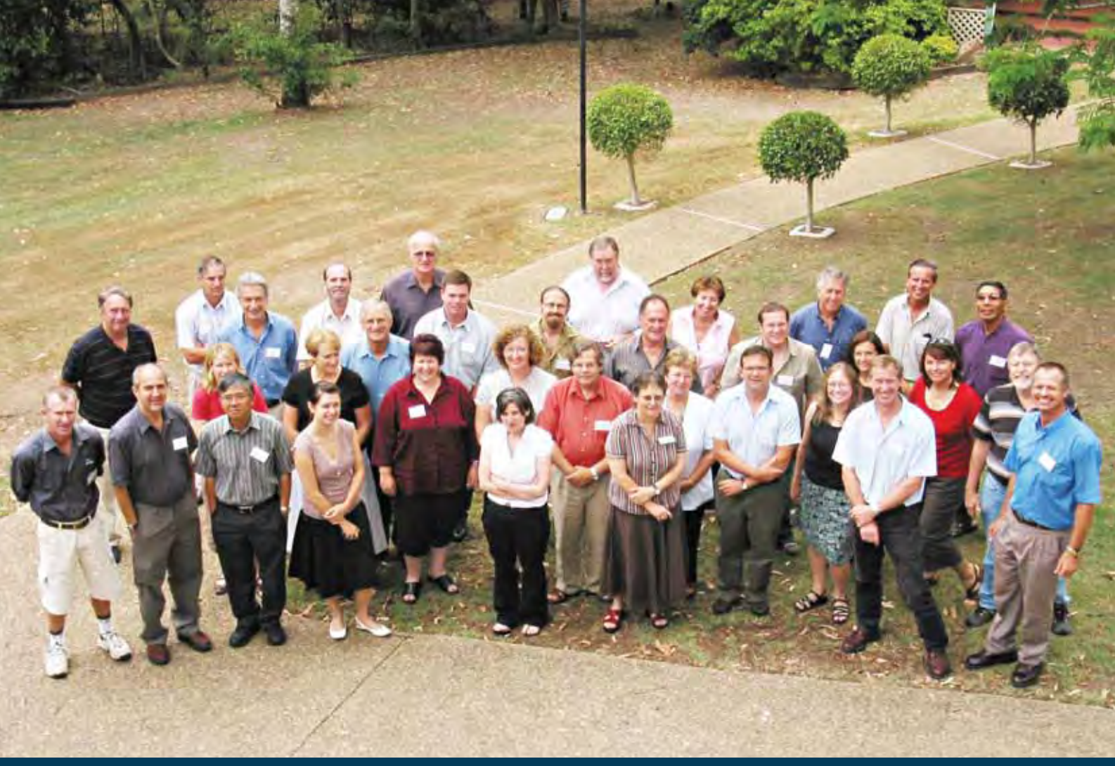
Researchers and agriculture industry representatives attended the Soil Health Forum in Brisbane, December 2006, where the project began.

to implement strategies for improving soil health and had only recently recognised its importance. This contrasted with the efforts in Australia's dryland agriculture and the cotton and other field crop industries.