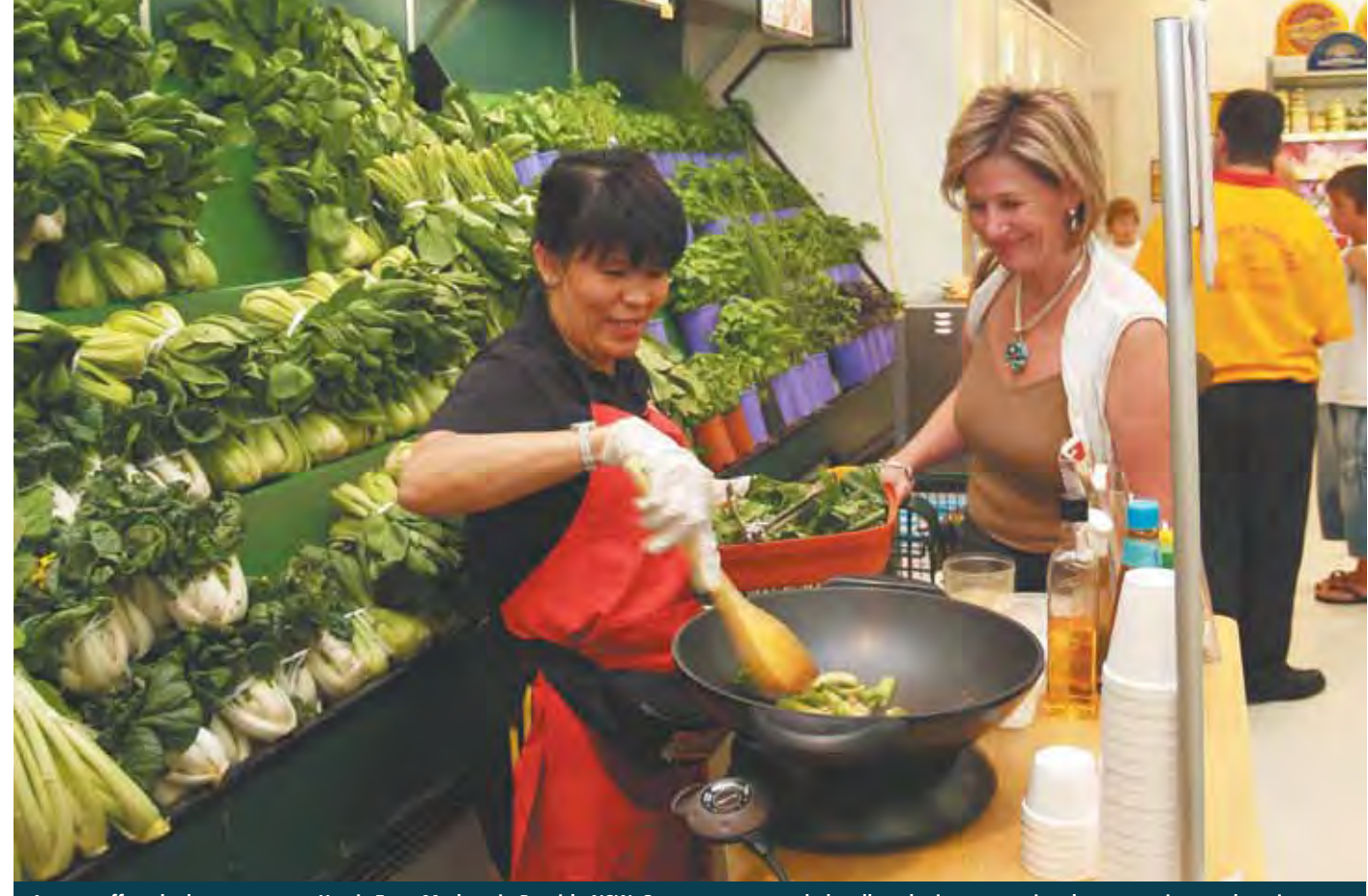
Ayam staff cooked up a storm at Harris Farm Markets in Penrith, NSW. Consumers responded well to the in-store recipe demonstrations and tastings.

A project was developed to standardise the names of Asian vegetables and devise a marketing strategy to promote them to the wider community. Standardised names were launched in November 2005; since then, research has been conducted into devising a marketing strategy.