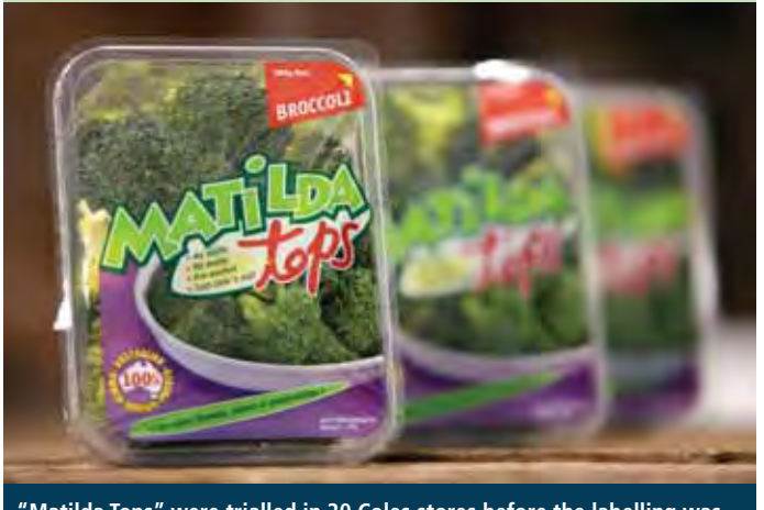
"Matilda Tops" were trialled in 20 Coles stores before the labelling was changed to "You'll love Coles".