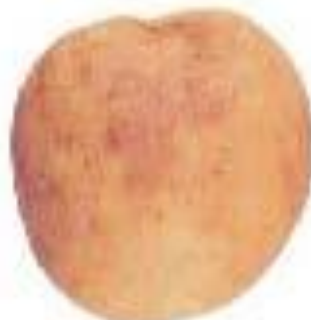
Style B - Moderate