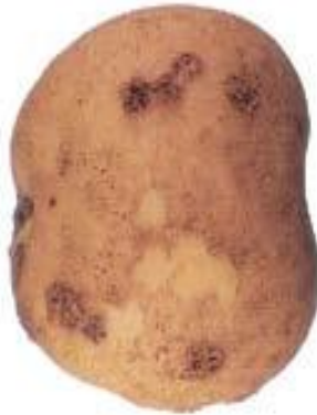
Style B – Moderate (approx. 7 lesions)