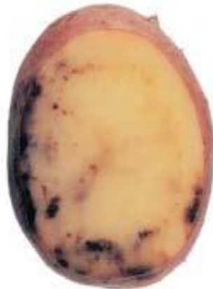
Style B Immediately after cutting