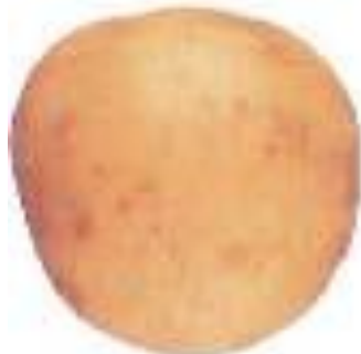
Style A - Slight (less than 5% of surface area)

Silver scurf ( Helminthosporium sp.)/ Black Dot ( Colletotrichum sp.)