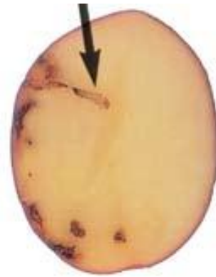
Cross-section (larva arrowed)