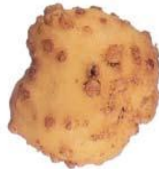
Style C Severe Infestation