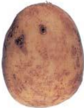
Style A – Slight (approx. 2 lesions)