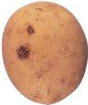
Style A – Slight (approx. 2 lesions)