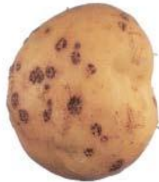
Style C – Severe (approx. 20 lesions)