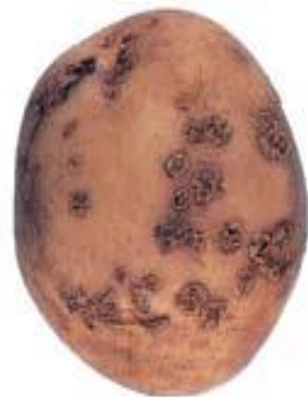
Style C – Severe (approx. 20 lesions)