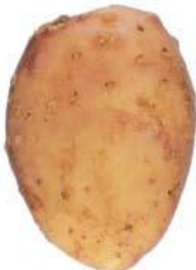
Style A Slight Infestation