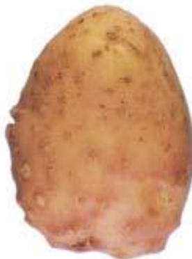
Style B Moderate Infestation