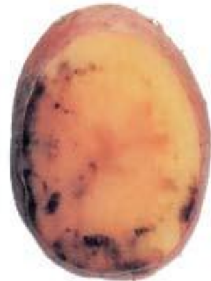
Style C Approx. 20 minutes after cutting