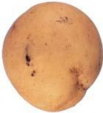
Surface Damage (larva)