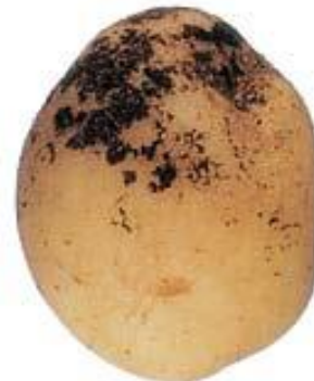
Style C - Severe (approx. 20% of surface area)

Silver scurf ( Helminthosporium sp.)/ Black Dot ( Colletotrichum sp.)