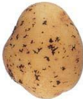
Style B - Moderate (approx. 10% of surface area)