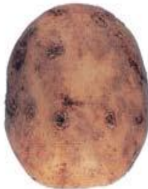
Style B – Moderate (approx. 7 lesions)