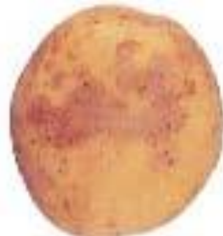
Style C - Severe

(approx. 10% of surface area) (approx. 20% of surface area)