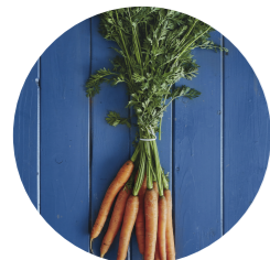
Source: ABS. Australian Agricultural Commodities, 2014-15

FACT: Carrots first came to Australia in 1788 with the First Fleet. Convicts planted 'Long Orange' carrots on Norfolk Island just two weeks after their arrival and gathered in their first harvest in October of that year.