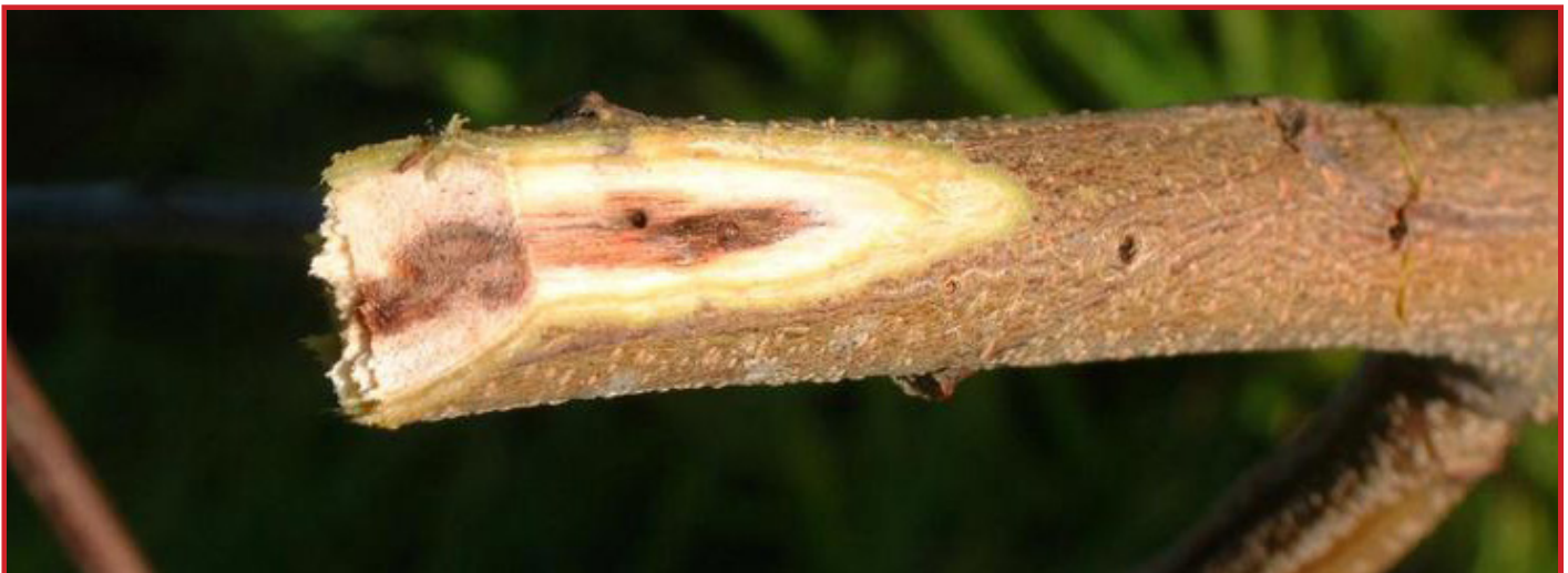
Figure 1. Black twig borer ( Xylosandrus compactus ) damage

This is unlikely. While Australia does have a few native species of Xylosandrus beetle that are of similar size and shape, these only occur in far north Queensland. Native species are unlikely to be confused with Black twig borer as they do not feed on healthy or even stressed plants, and they are generally much paler in colour – usually tan-brown instead of very dark or almost black.