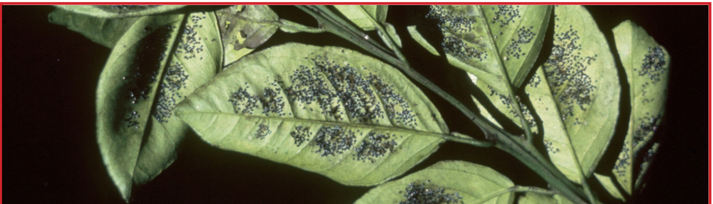
Figure 1. Citrus blackfly ( Aleurocanthus woglumi ) damage

Citrus blackfly larvae can be confused with other species of blackfly and whitefly, most notably the orange spiny whitefly ( Aleurocanthus spiniferus ), a species present in Australia that has morphologically similar pupae and adult life stages. This similarity will make confident field identification difficult. A trained entomologist is required to make an accurate identification, which may require examining juvenile stages on slides under a microscope to make out specific morphological details.