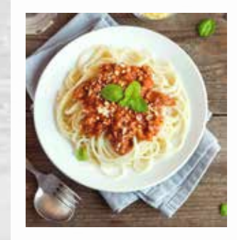
Add ONIONS to your kids' FAVOURITE MEALS, whether it's spag bol, mac n cheese or shepherds pie