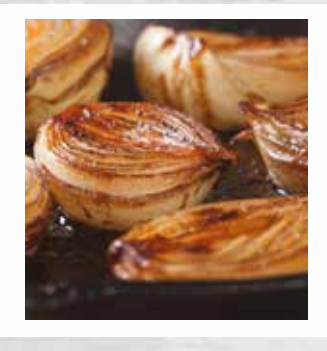
Throw in a few small onions when making roast vegetables. The SUCCULENT SWEETNESS will add a unique taste dimension