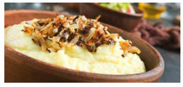
POTATO AND ONION

two staple ingredients that work magic together. Whether lightly sautéed, combined to make a creamy onion mash or grated and fried in a rosti, together these become so much more than the sum of their parts