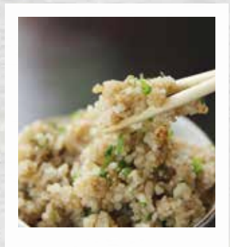
Include finely CHOPPED ONION into fried rice or San Chov Bau for DELICIOUS FLAVOUR and aroma