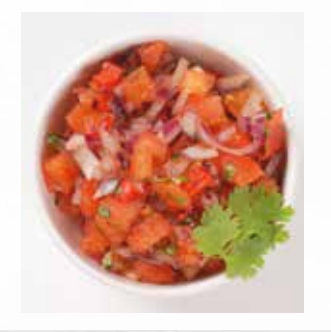
Fresh SPICY ONION tomato salsa goes well with chicken, fish or meat