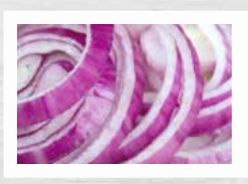
RAW ONIONS lend a sharp, crisp edge to DIPS AND SALADS

two staple ingredients that work magic together. Whether lightly sautéed, combined to make a creamy onion mash or grated and fried in a rosti, together these become so much more than the sum of their parts